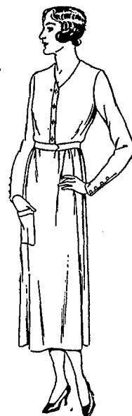
The "NEW BRIGHTON." Nurses' Uniform Dress. Nurse cloth—

Nurses' Overall Dress. White Pique, or Drill. Short sleeves ... 9/11 Long sleeves ... 10/11 S.W., W. and O.S. Made to measure, 1/6 extra.