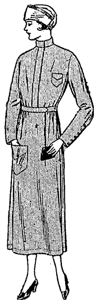
The "RODNEY" NURSES' UNIFORM DRESS.

We specialise in NURSES' Wear. Our Overalls are made specially for us and are unequalled in Style, Cut and Value.